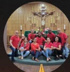
MINISTERIO UNIDOS EN CRISTO